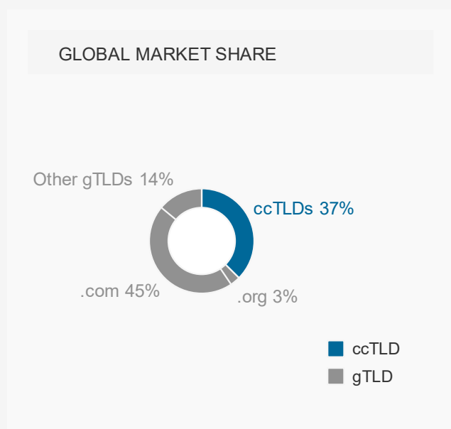
FIGURE 3: Statistics and trends in global domain registrations