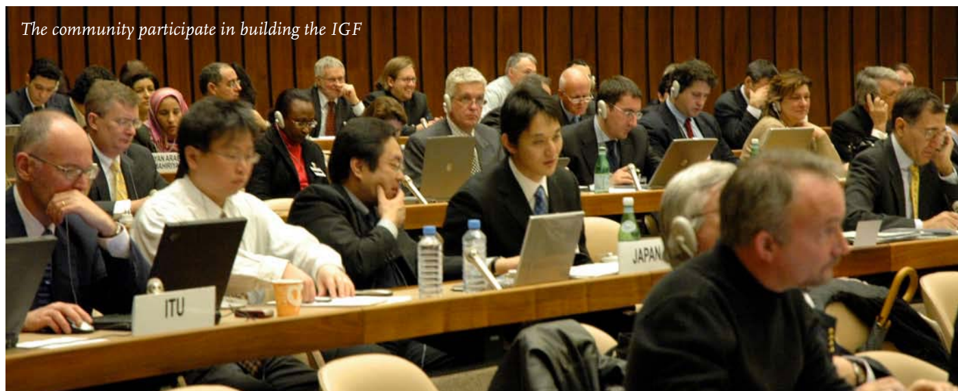
The community participate in building the IGF

There are many aspects related to the issue of Internet governance and it is not possible to approach it from one